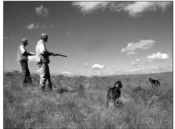
The Upland Habitat Initiative provides better quality pheasant hunting opportunities through improved upland game bird habitat.

Candidates for the habitat specialist position are now being interviewed. The project is expected to begin early next year.