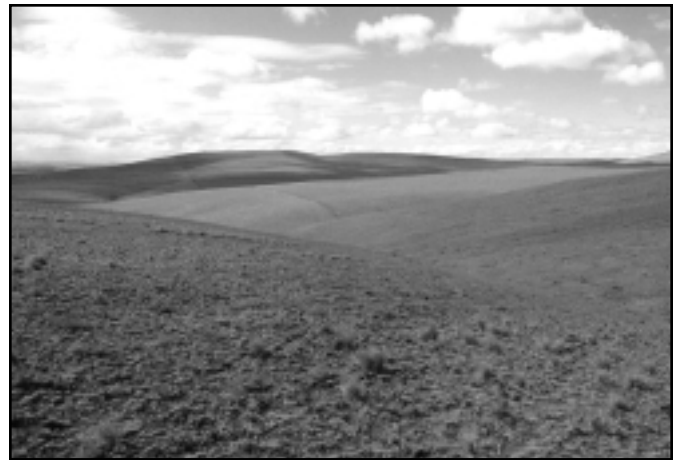
Over 12,000 acres of upland game bird and mule deer habitat will be available just outside Pendleton, when the new Coombs Canyon Regulated Hunt Area opens this fall.

For Wolfe, joining the regulated hunt area program would allow him to receive financial assistance for improving wildlife