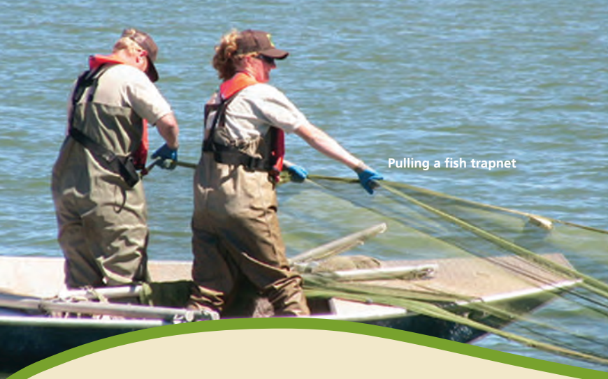
Pulling a fish trapnet